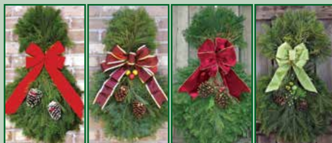
Classic $17.00 each